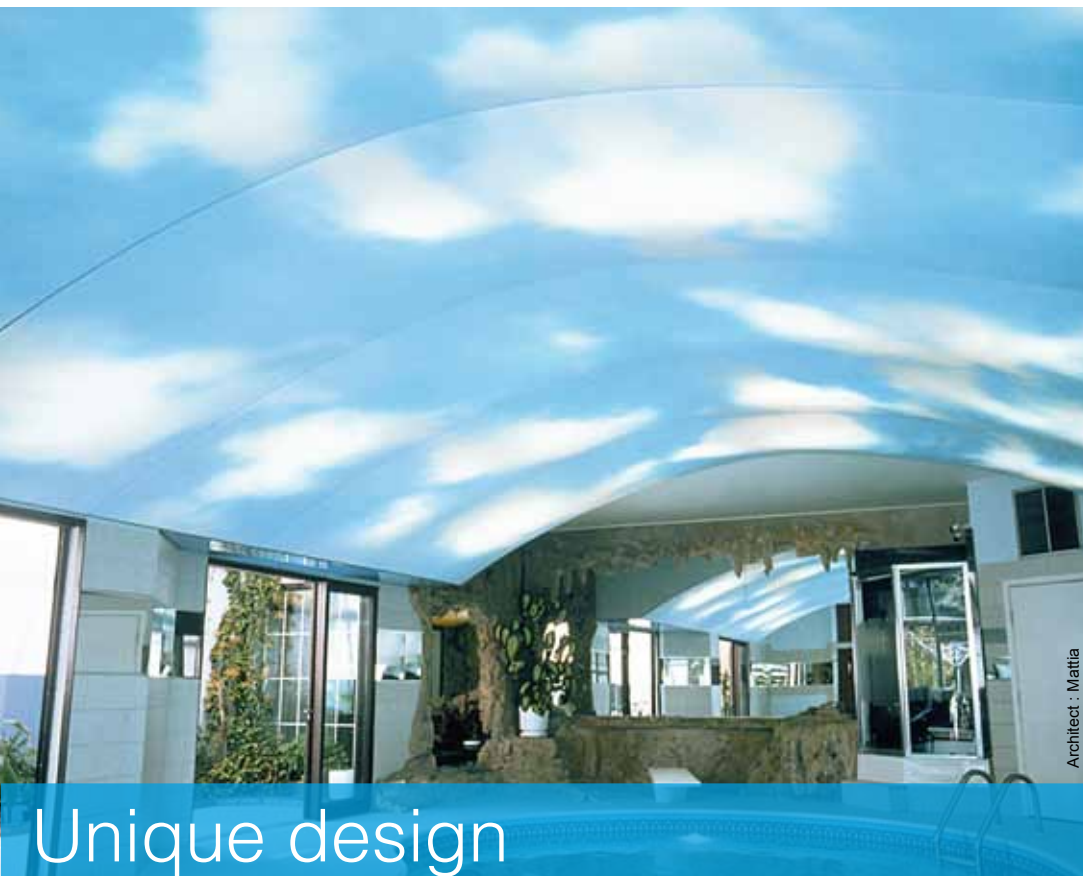
Architect : Mattia