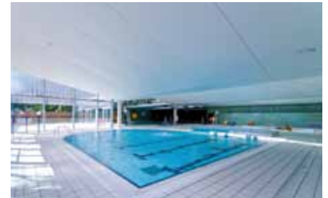
Architect : Atelier Po&Po

With the Acoustics® line , Barrisol® provides solutions to efficiently resolve acoustic problems in public and private swimming pools.