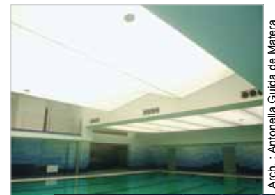
Arch. : Antonella Guida de Matera

Embedded spotlights, optic fibers, luminous ceilings with dimmable and changing colors, choose your lighting solution to create your own space of well-being and relaxation.