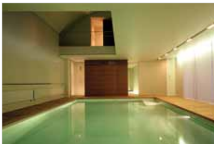
design : P & E Interiors