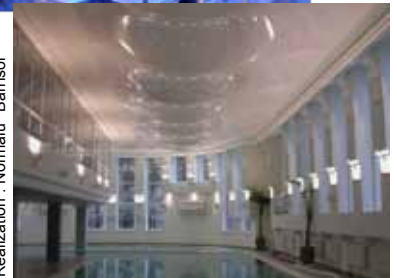
Realization : Normalu® Barrisol®