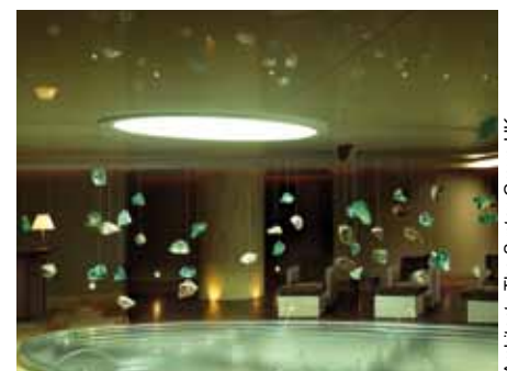
Architect : The Syntax Group UK

With Printed Barrisol® , plunge into another universe! Create your own decoration thanks to digital printing on Barrisol® sheets. It is possible to reproduce all photos, patterns or decors of your choice for a totally personalized atmosphere. Your printed ceiling can be combined with Barrisol® Lighting solutions to create an unique backlit atmosphere. With Printed Barrisol®, the only limit is your imagination!