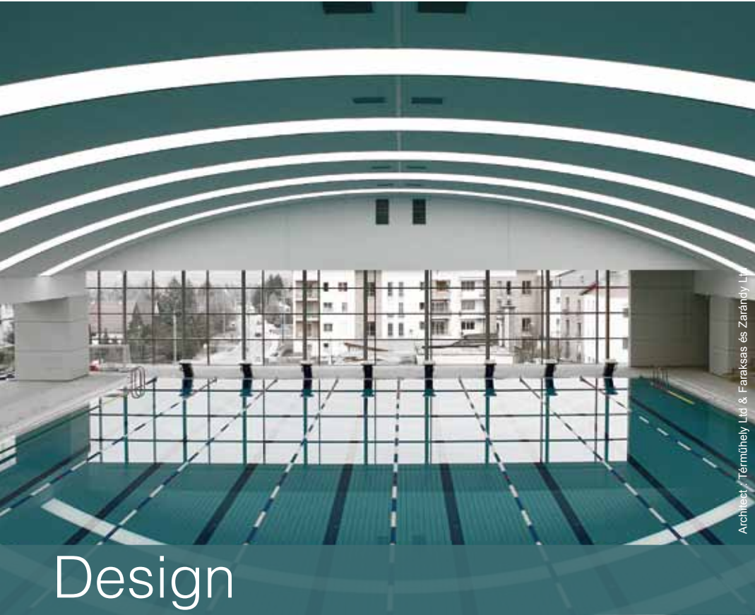
Architect: Térműhely Ltd & Faraksas és Zarándy Ltd