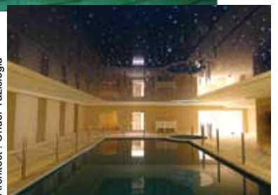
Architect : Onder Yazicioglu