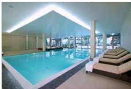
design : Timbette