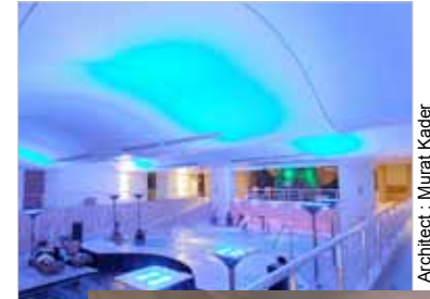
Architect : Murat Kader

Dare to create a 3D ceiling to enhance the design of your swimming pool and admire an original, surprising and unique design.