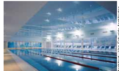
Architect: Van Eetvelde Architecten

For your security, Barrisol® meets or exceeds the fire classification M1 (bs2d0 in Europe), the Euroclasses, the CE marking "Conformité Européenne", Class A, etc. and is UL Classified.