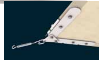
Barrisol® Trempo® by springs