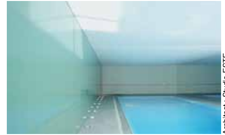
Architect: Studio ESTE

Due to its unique composition, the Barrisol® sheet can be used in humid spaces. Barrisol® solutions are ideal to decorate and renovate public or private spaces.