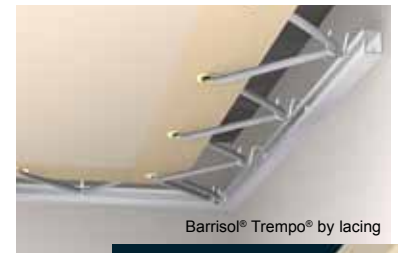
Barrisol® Trempo® by lacing

To answer every decorative ideas, all the Barrisol® sheet can be stretched with the Trempo® system.